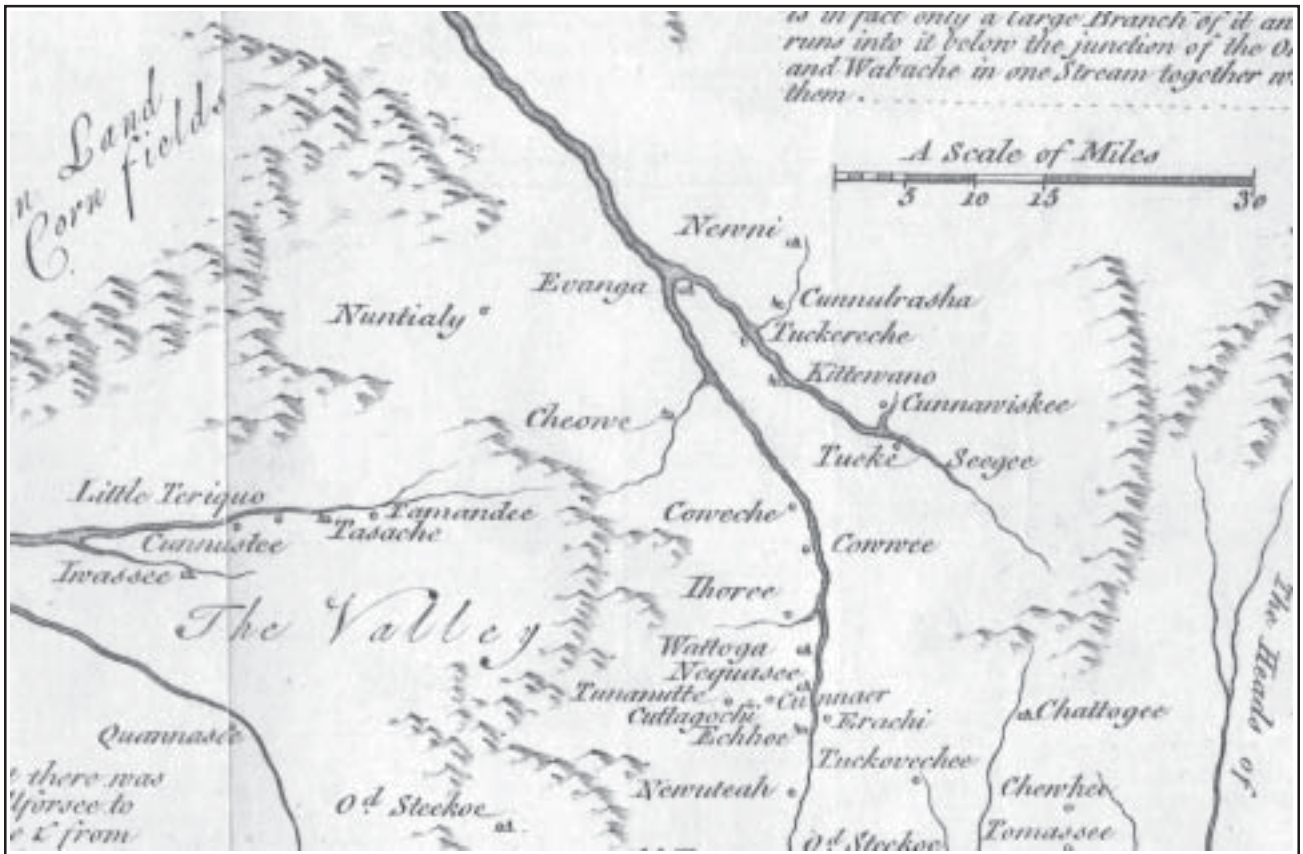
Figure 4.1. Portion of Kitchin (1760) map showing “Evanga.”